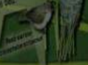
Reed warbler Sylvia hortensis