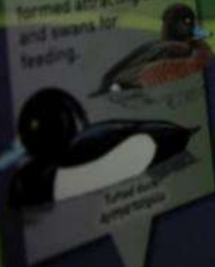
Tufted duck Aythya fuliginea

The roots of reed, marginal and water sedge trap in the water to take up nutrients and trap sediment as the water flows past. Water voles have been seen nesting on these plants.