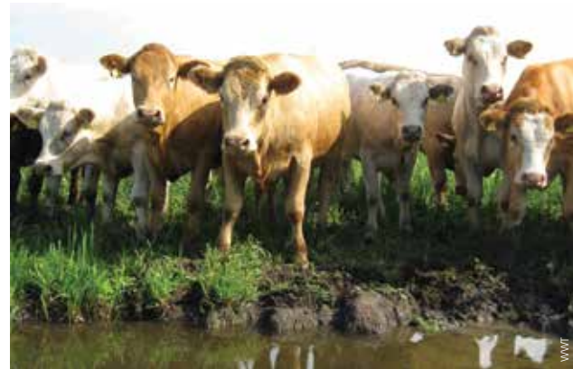
Cattle grazing in summer