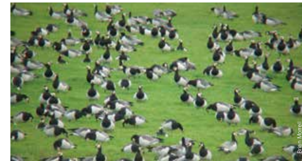
Barnacle geese grazing

in focus The Binocular and Telescope Specialists