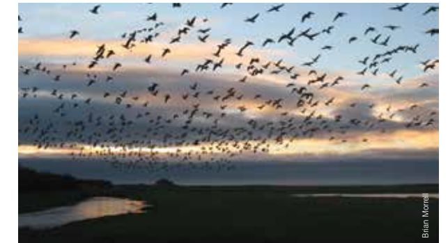
Dawn barnacle geese