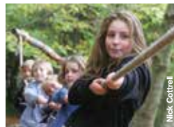
Wild wood play

Wild wood play – our woodland natural play area is a novelty for both children and adults, taking you back to your childhood days. It's also an ideal picnic spot.