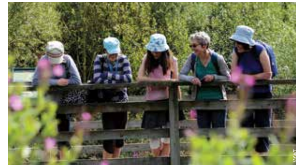
Group days out

Hot food served: 12noon - 2pm winter, 12noon - 3pm summer.