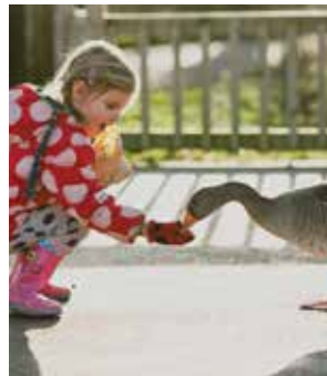
Feeding the birds