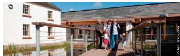
Castle Espie Wetland Centre

Family activity backpacks – pick up your binoculars, magnifying glass and spotter sheets from reception and go out on your own adventure. Refundable deposit required.