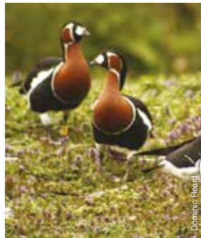
Red breasted geese