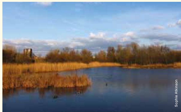
Wetland Centre View

Peacock Tower – visit our three storey hide for panoramic views across the reserve.