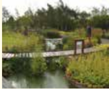
RBC Rain Garden

RBC Rain Garden – a beautiful wildflower meadow and creature habitats offer inspiration for your garden back home.