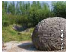
Swan's nest maze