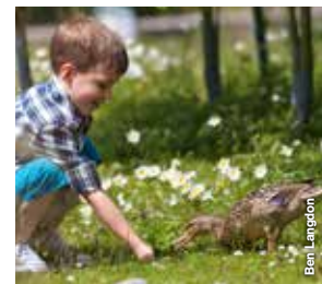
Feed the ducks

Activities include pond dipping , mini-beast hunts , den building and crafts (all seasonal). Meet our fluffy ducklings in May half term at our downy duckling days and in the school summer holidays we have a canoe safari (weather permitting) and bike trails . Some age restrictions apply.