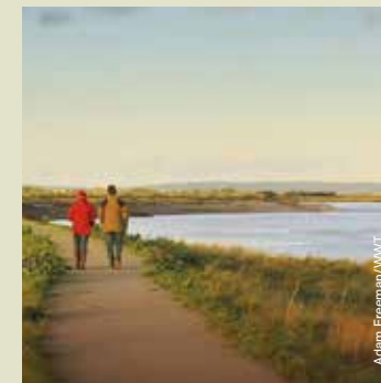
Long walks at Steart

Fancy a cuppa? There's no cafe on site, but it's an ideal picnic spot. To purchase refreshments, follow signs to the larger local villages and towns.