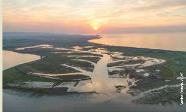
Steart from the air

Our coastline is constantly changing. We're working here to help form special new habitats for wildlife, improve flood management for local people and provide an amazing place to visit. This new piece of wild Britain is one of WWT's wetlands working for both people and wildlife.