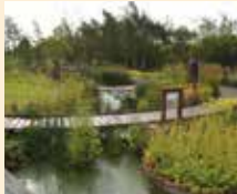
RBC Rain Garden

RBC Rain Garden – a beautiful wildflower meadow and creature habitats offer inspiration for your garden back home.