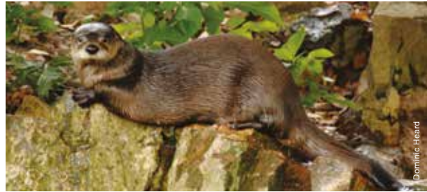
Meet the otters at a talk