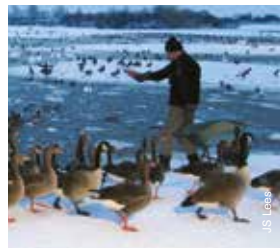
Wild bird feed

Commentated wild bird feeds (November to February) – take a seat in our heated Peng observatory and listen to our warden as he feeds thousands of ducks, geese and swans.