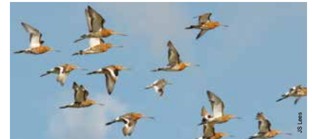
Black tailed godwits