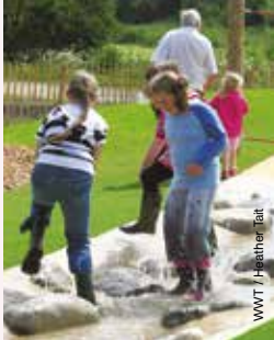
Welly boot land

South lake discovery hide – visit our comfy newly redecorated hide which includes all the equipment you need to see wildlife up close. It's great for families or for those who are just starting out as birdwatchers.