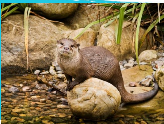
Asian short-clawed otter

http://www.wwt.org.uk/wetland-centres/london/plan-your-visit/accessibility/