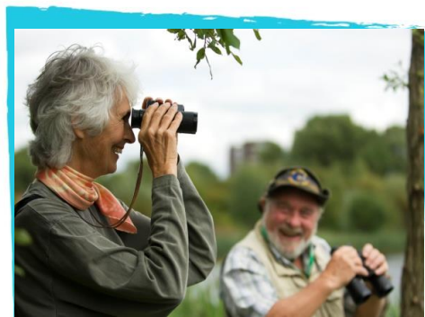
Bird watching

And as an added incentive – every penny spent on a group visit contributes to WWT's vital conservation work in the UK and all around the world.