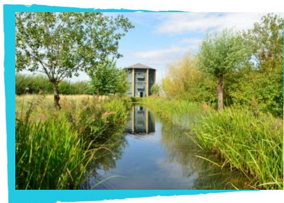
Three storey Peacock Tower

We can provide a general guided tour to discover more about the history of the Centre and its wildlife. A minimum two weeks' notice is required when booking these tours. Tours are provided at a charge of £25.00 and can accommodate up to 20 people, so if you have a very large group you may need to book more than one guide.