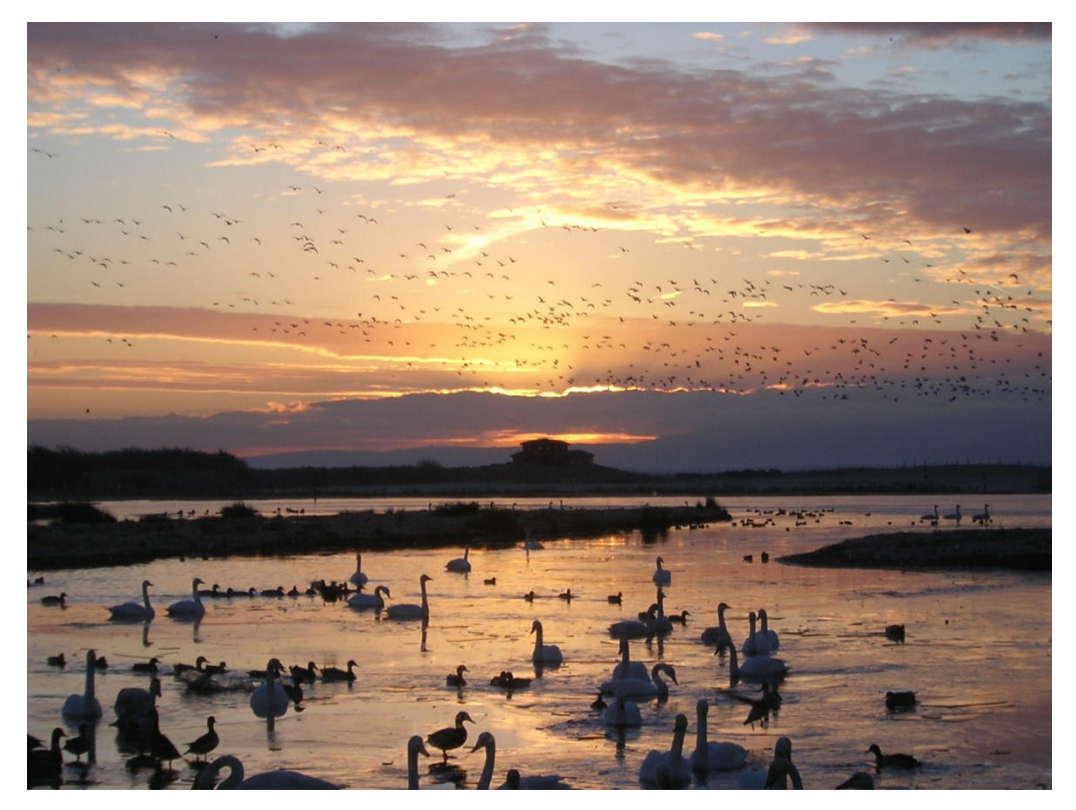
Figure 2-4. Maintaining healthy wetlands by applying the concept of wise use is the single greatest contributor to health in wetlands ( WWT ).

Proactive strategies aim to prevent disease introduction or an outbreak of existing disease and will always be more cost effective than dealing with the consequences of disease emergence. In general, to apply the concept of wise use and maintain biodiversity and ecological function i.e. maintain healthy wetlands, will provide the greatest contribution to health.