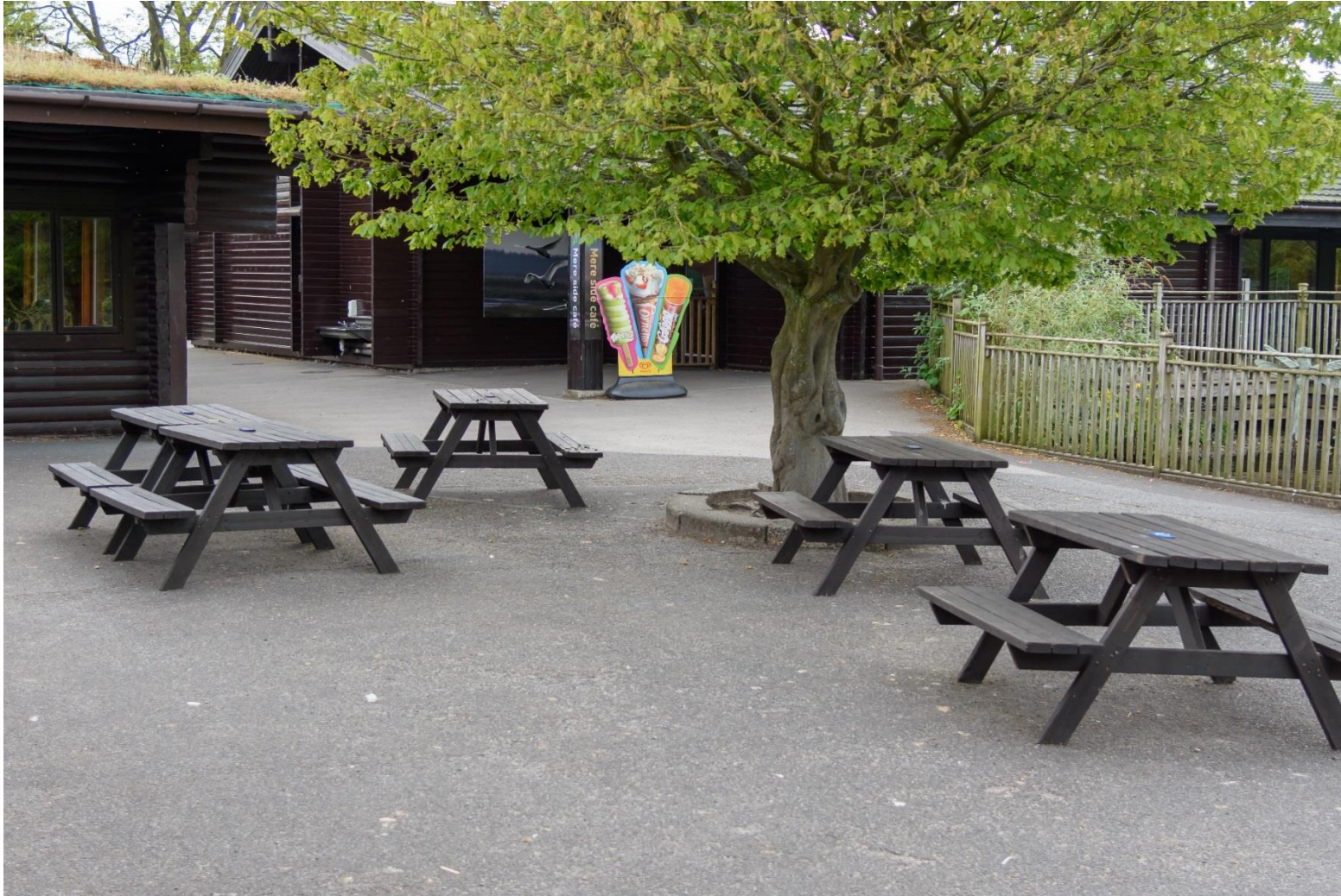
Outside the door there is an outdoor picnic area. To the right is the Mere Side Café building.