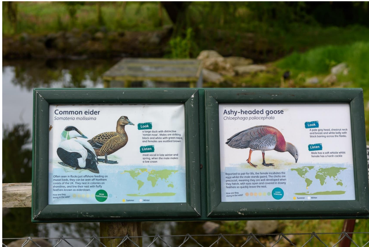
Species labels tell you all about the birds that you can see.