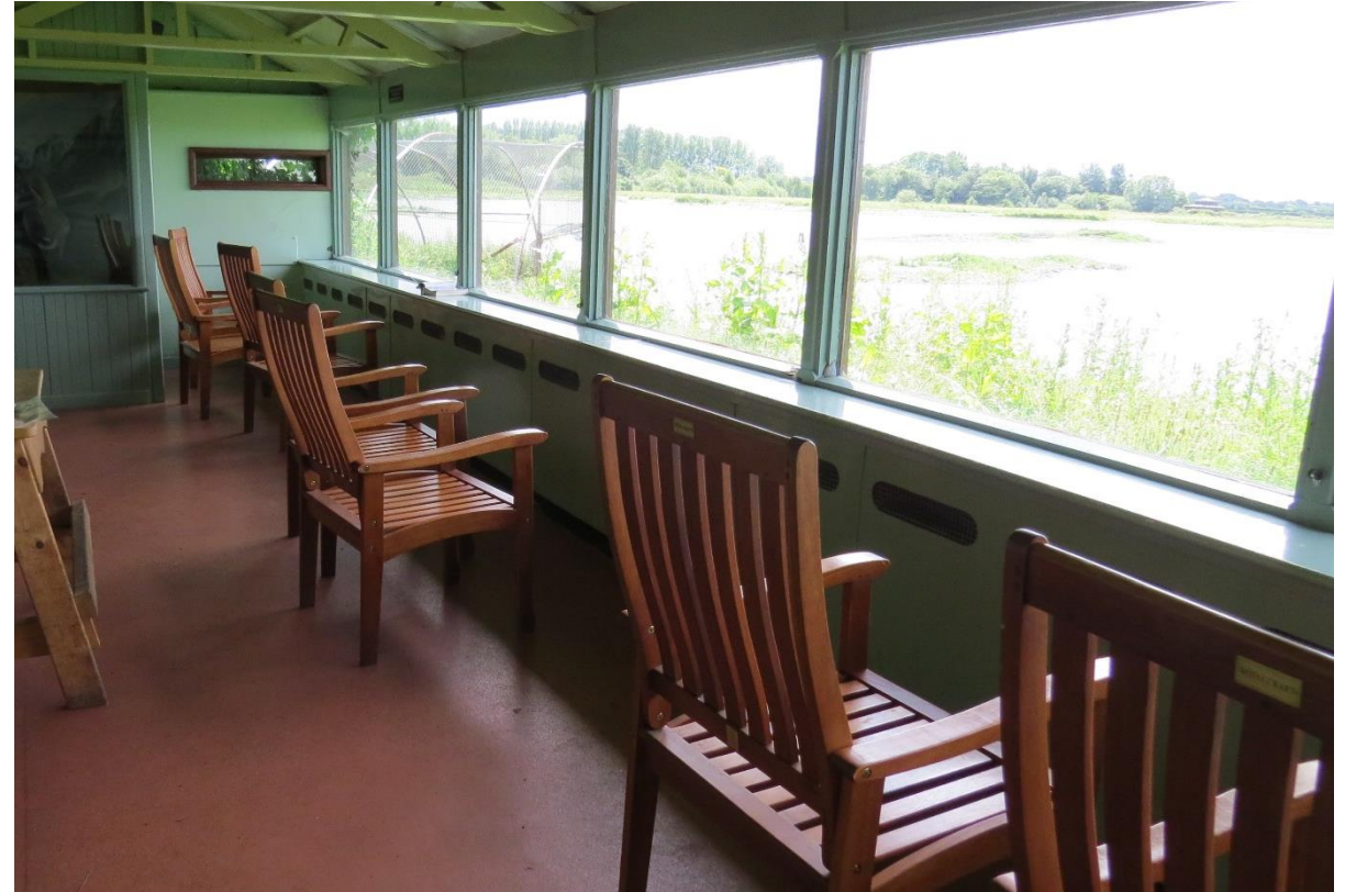
Hides have either lower windows for wheelchair accessibility or large glass windows for wildlife viewing. Some of the hides can appear dark upon entering.