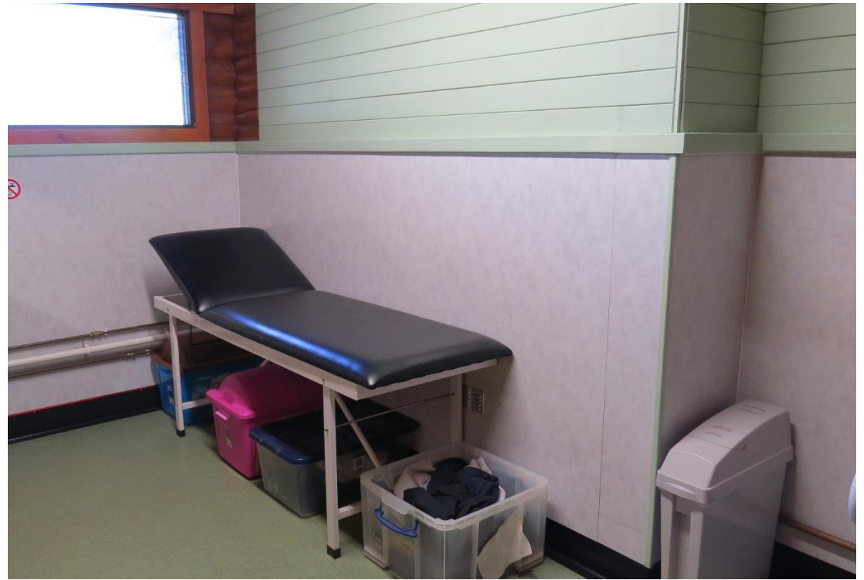
The large accessible toilet has a changing table available as well as spare clothing and an accessible toilet. This toilet facility does not have a hand dryer.