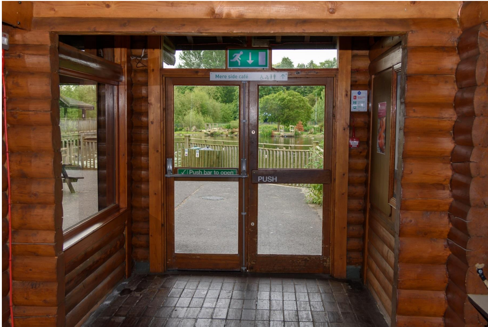
There is an exit next to the exhibition hall that leads you to the Mere Side Café.