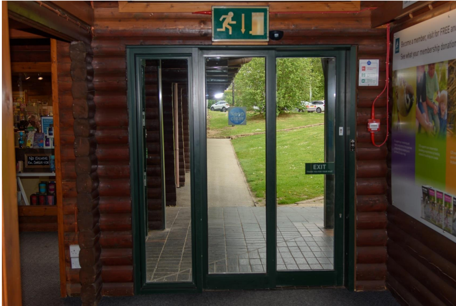
The exit back to the car park is at the main entrance via an automatic door.