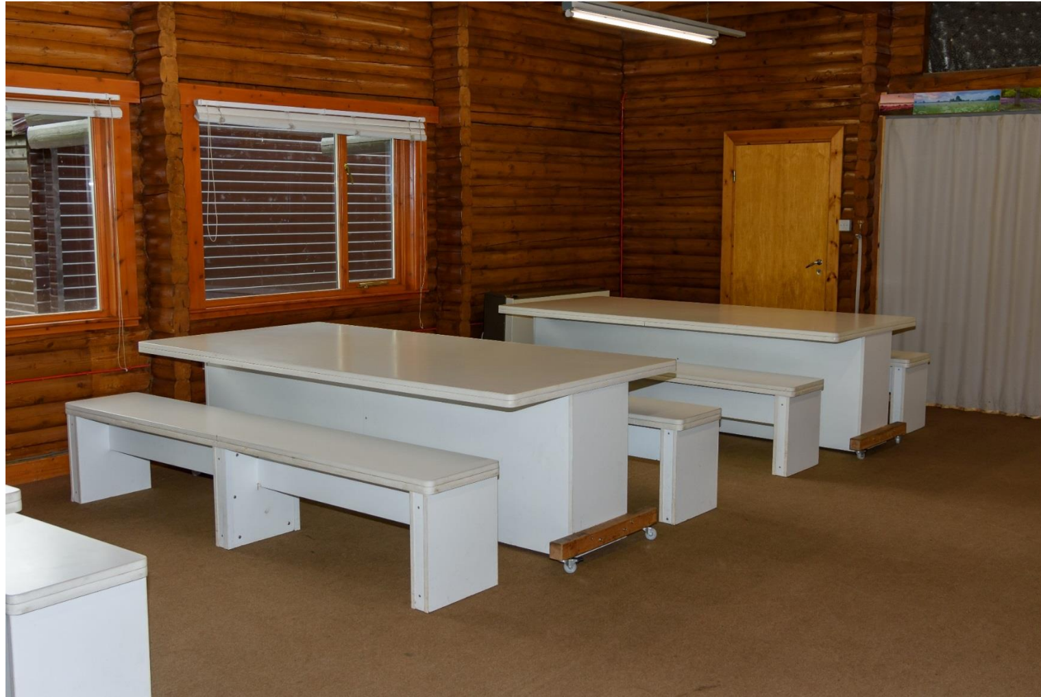
The picnic room has large windows with sturdy benches. High chairs are also available in this picnic room.