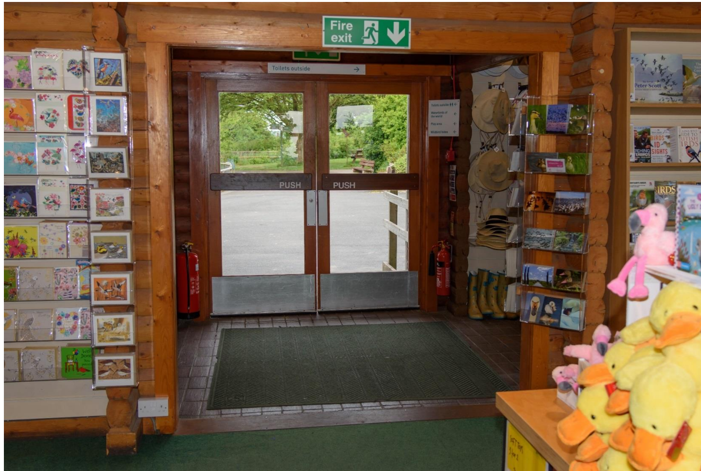
The primary entrance into the grounds is through the retail shop.