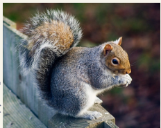
4 (Grey) squirrel