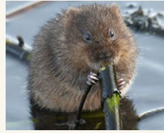
3 Water vole