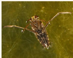
4 Water boatman