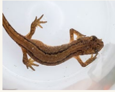
1 (Smooth) newt