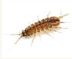
5 Water hoglouse

If you get stuck, they're all featured on the Wetland Wildlife Cards used previously (see final pages of food chains session plan).