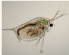
4 Daphnia or water flea