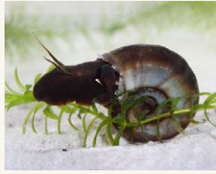
1 Ramshorn snail