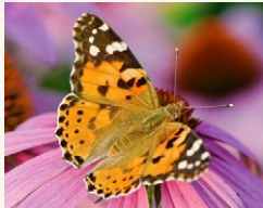
(Painted lady) butterfly