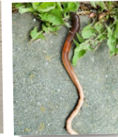
Detritivore (also allow herbivore)