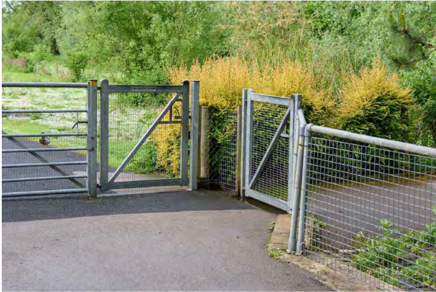
Metal gates are used throughout the grounds to separate the themed bird areas.