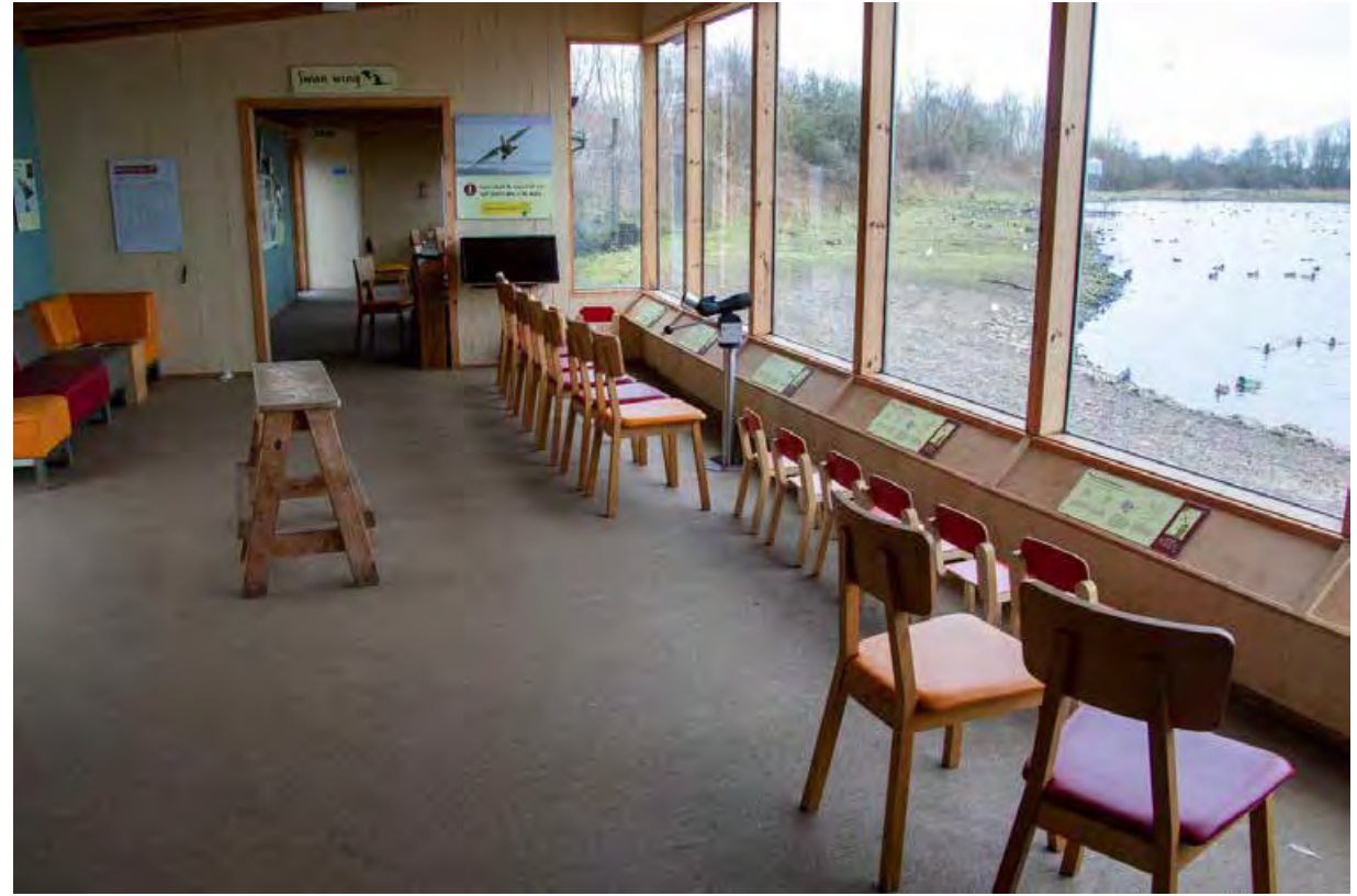
The entrance to the hide is double doors and there are large windows with comfy seats available in this hide. The hide overlooks the mere that is full of wild swans and geese in autumn and winter.