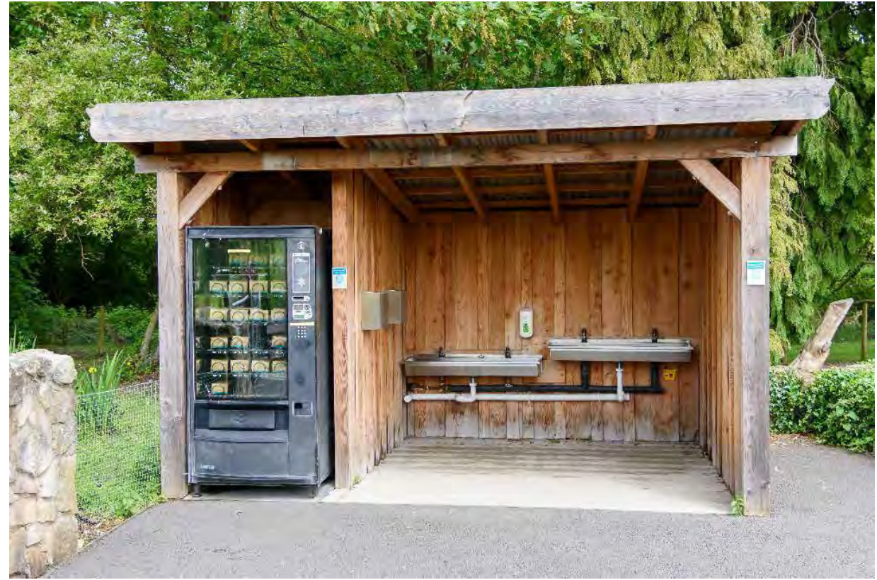
There are 3 points around the grounds that have hand dryers. Outside the café, in the WOW area by the aviary and in Wooded Wetlands.