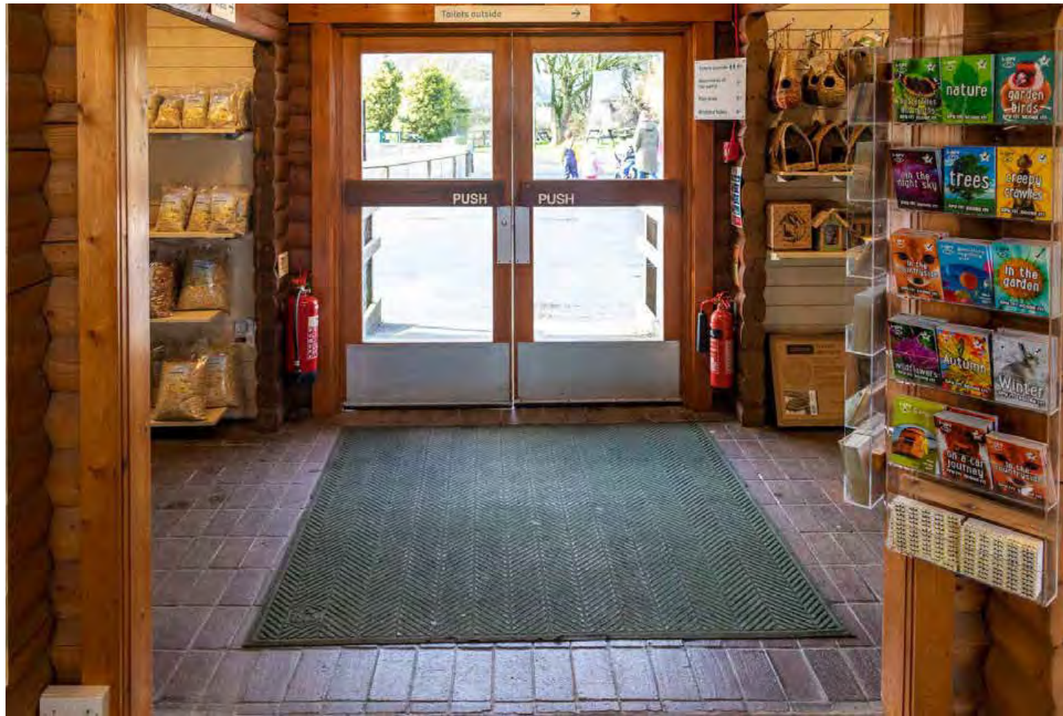
The primary entrance into the grounds is through the retail shop.