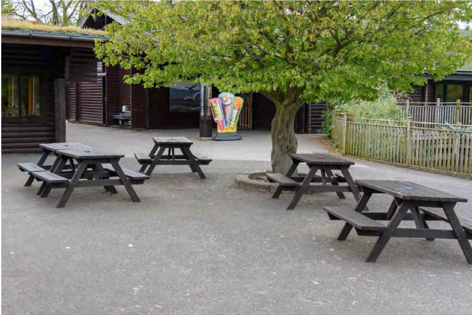
Outside the door to the Mere Side Café there is an outdoor picnic area. The Mere Side Café building is the large building directly ahead of you.