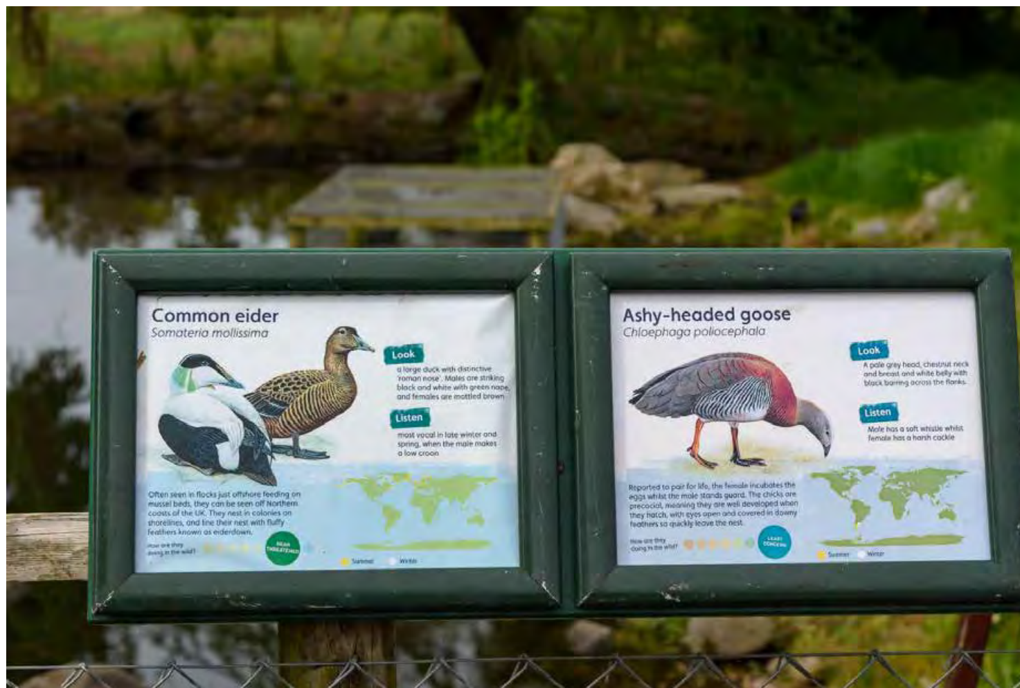
Species labels tell you all about the birds that you can see.