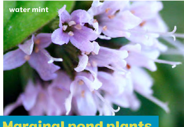
Marginal pond plants

Here are some of the most striking and easy to maintain native wetland plants.