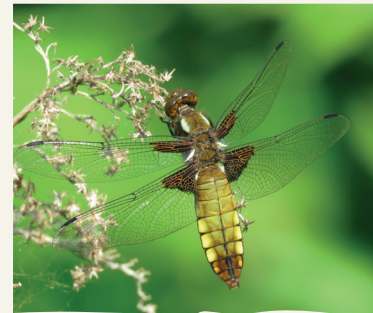
Broad bodied Chaser

Photography: Fixed points for placing your camera are dotted around the site.