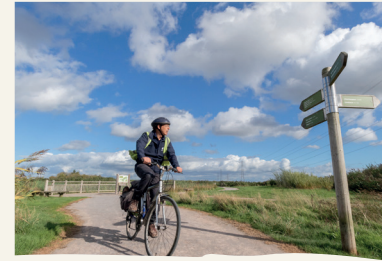
Cycling at Steart

Open daily 9am - 4.30pm. 2.1m height restriction in place at all times at Steart Gate car park.