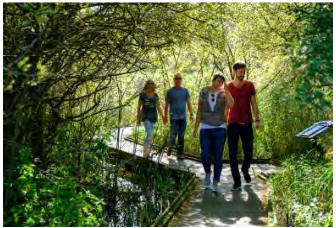
Woodland section of the reedbed boardwalk in summer