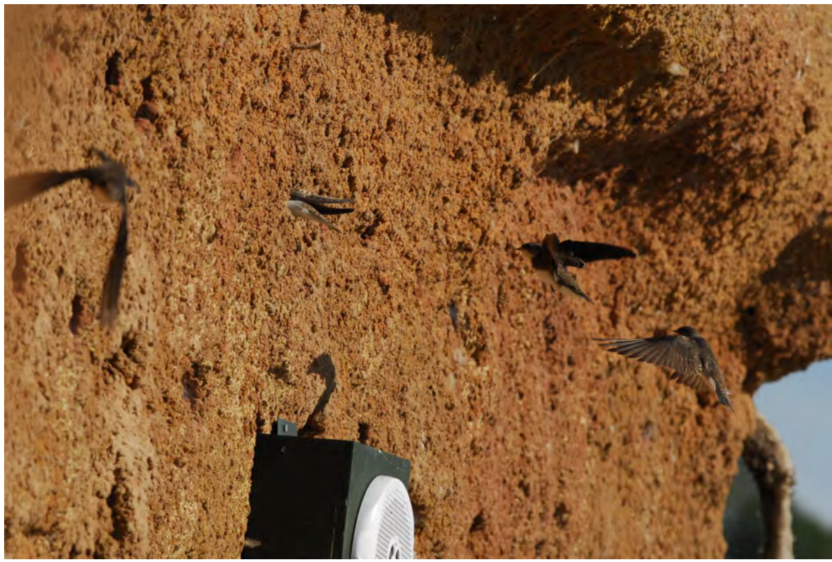
This hide is made to look like a sandy cliff bank and has nesting holes in it for sand martins. You can see sand martins here from April – September.