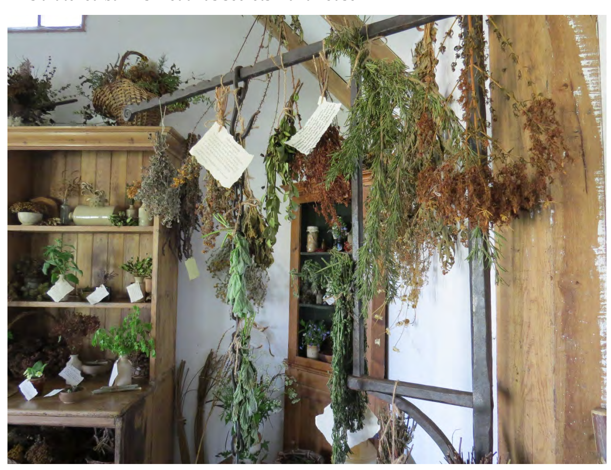
Inside is a display of the traditional uses of wetland plants