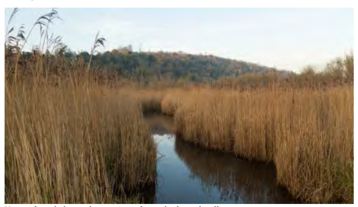
View of reed channels in winter from the boardwalk