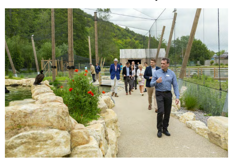
You can walk inside the aviary right next to birds, or stay outside