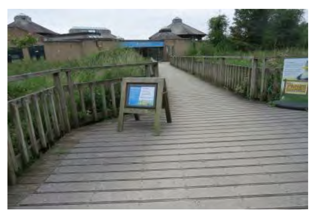
Here is the entry boardwalk you walk down to the Visitor Centre Building