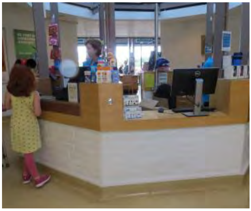
This is the admissions desk with lower access counter on front