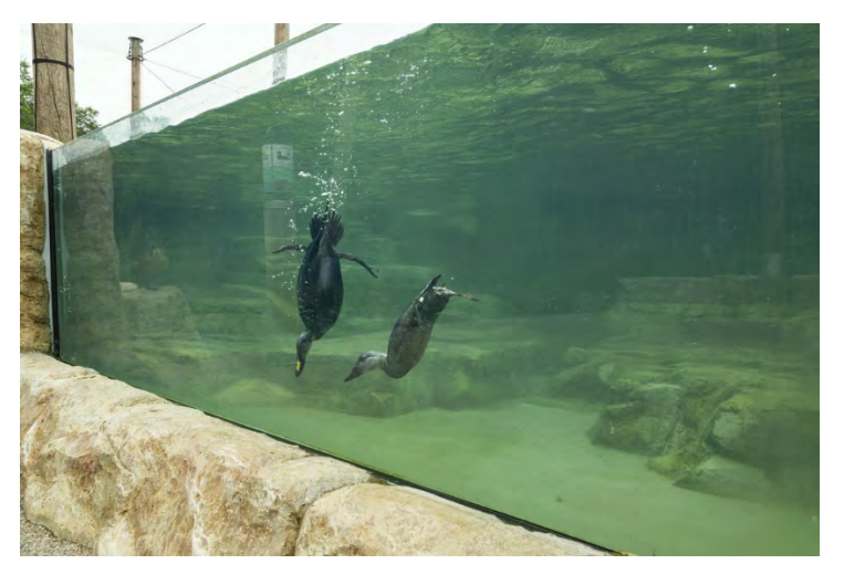
There is a large glass sided tank where you can watch the ducks dive – there is a free talk here at noon every day