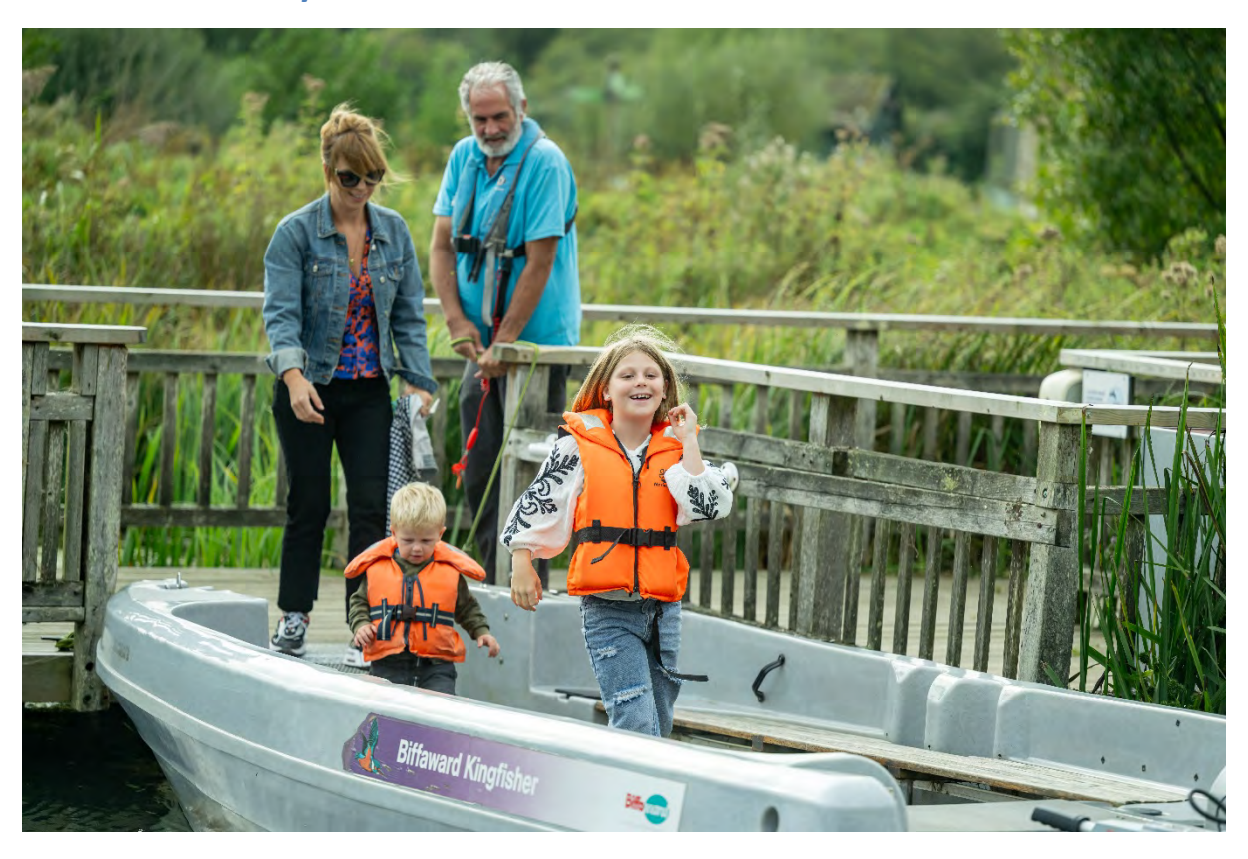
This is the boat jetty for getting onboard the Wetland Discovery Boat Safari – you buy tickets in the visitor centre at the Admissions desk for £3 per person.