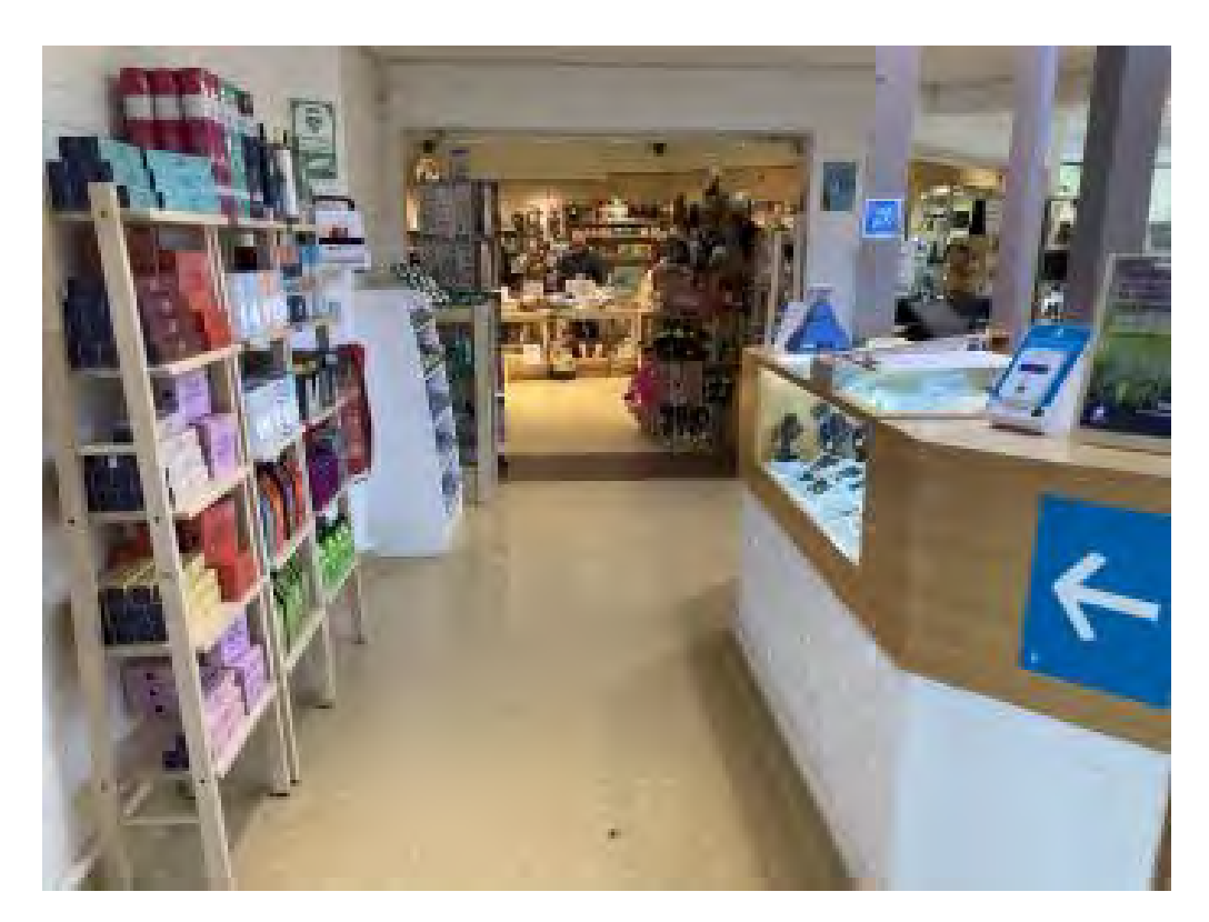
The gift shop is beside the Admissions desk