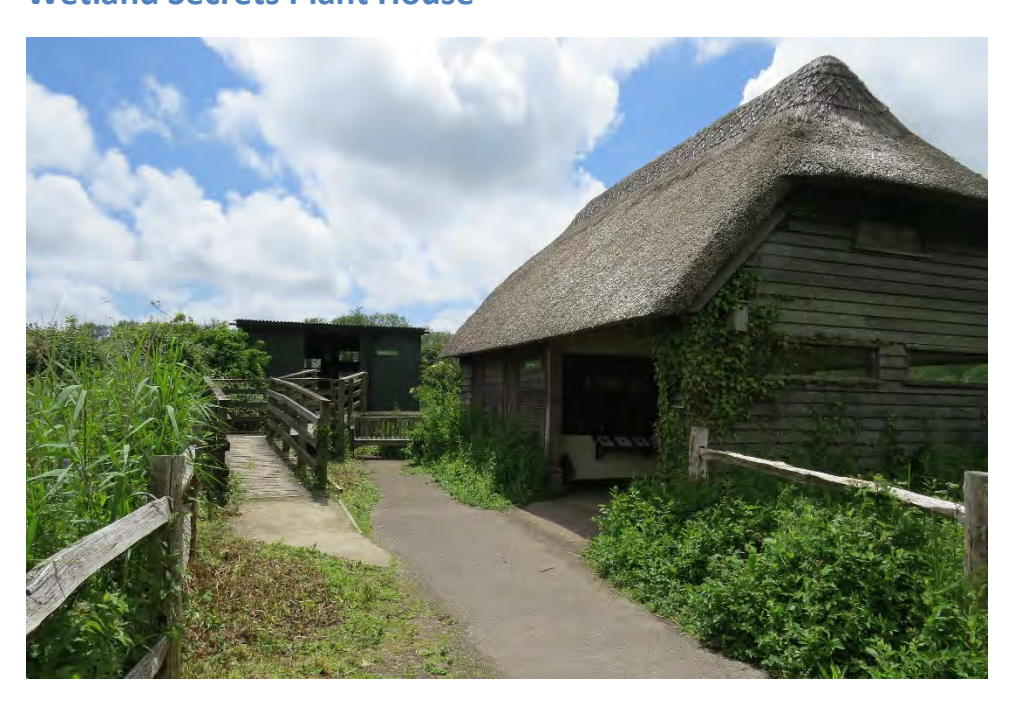
This thatched barn is Wetlands Secrets Plant House