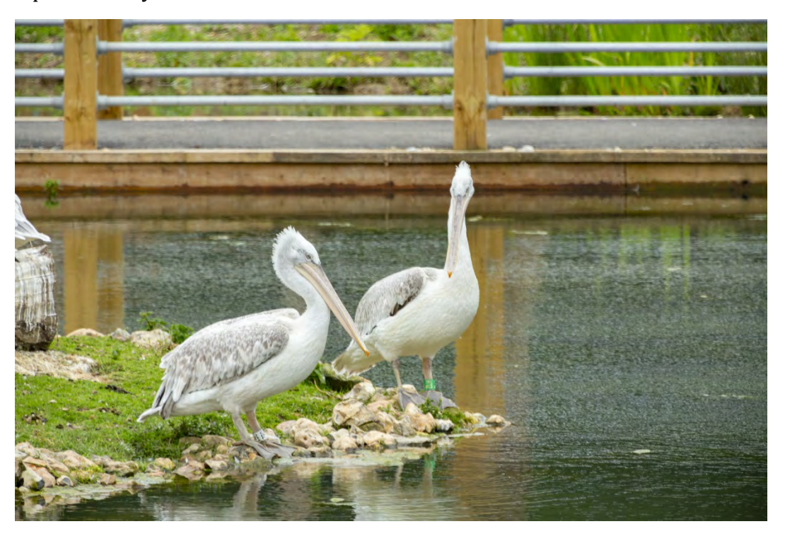
The Dalmatian Pelicans at Pelican Cove