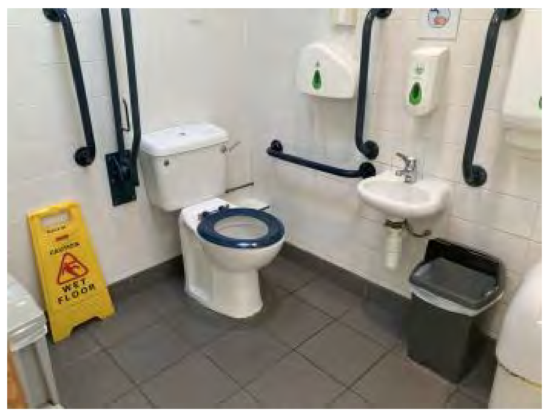
Inside view of the disabled toilet and baby change