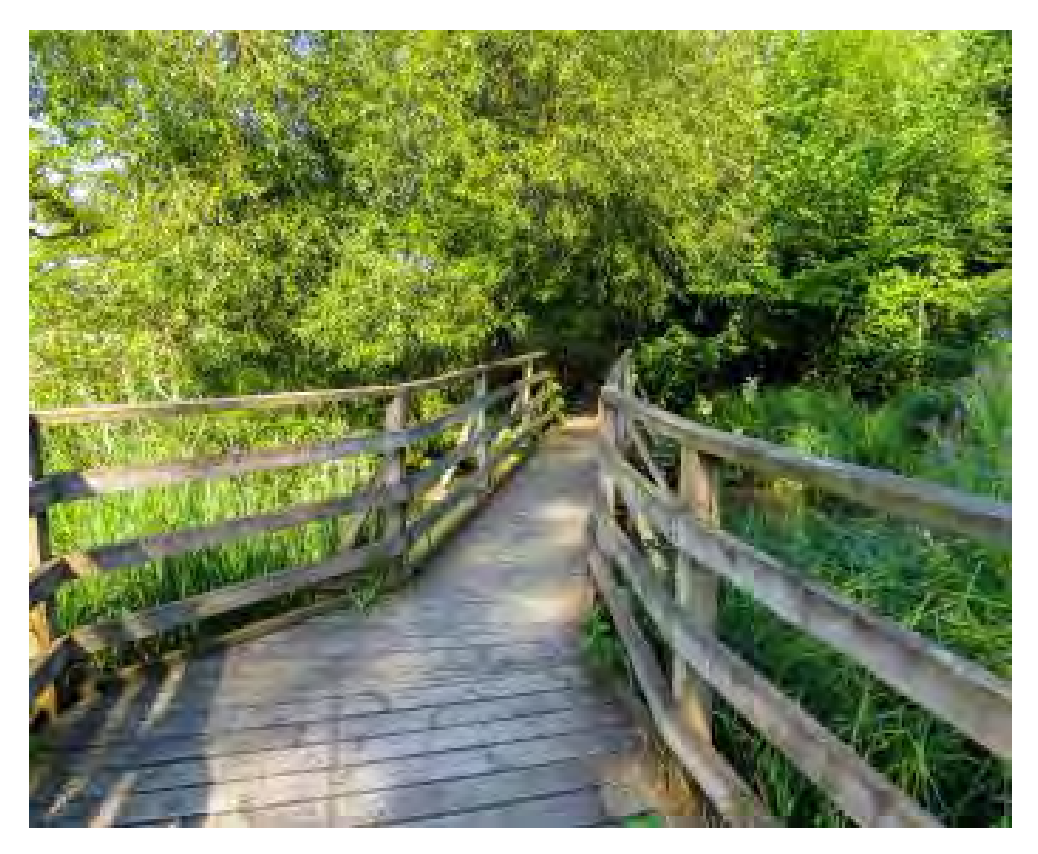
This is the entrance to the Reedbed boardwalk. The walk through SSSI Reedbed is beautiful with a wooden boardwalk with a lipped edge, grip-board and wired surface to prevent slips. The boardwalk widens in several places to allow easy passing and has two seating areas.