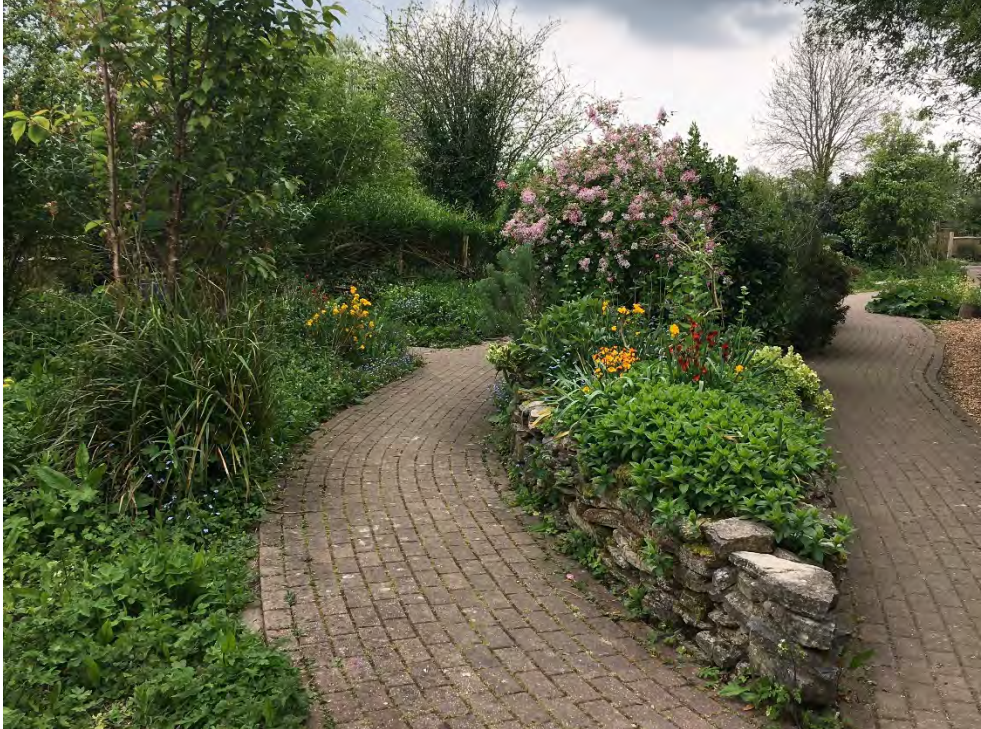
This garden has bug hotels and places to play plus benches to sit on.