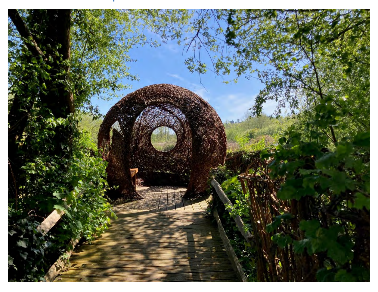
This large ball has wetland animals woven into it – you can sit inside!