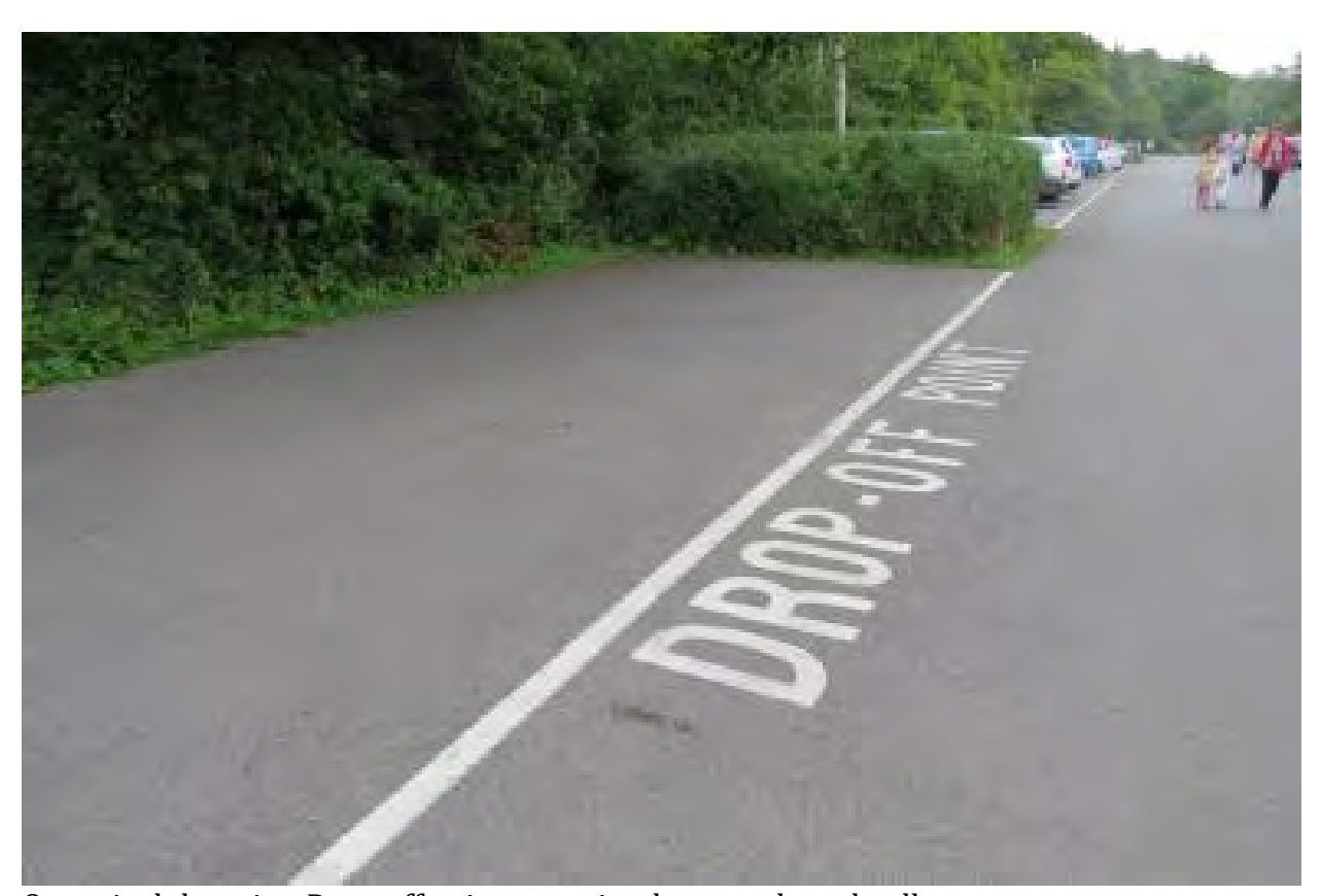
On arrival there is a Drop off point opposite the entry boardwalk.