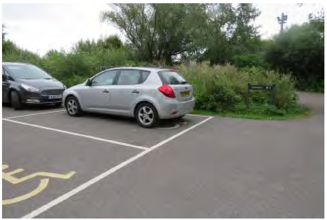
Nearby there are 8 Blue Badge holder bays in the car park with a path nearby to the visitor center.

Nearby there are 8 Blue Badge holder bays in the car park