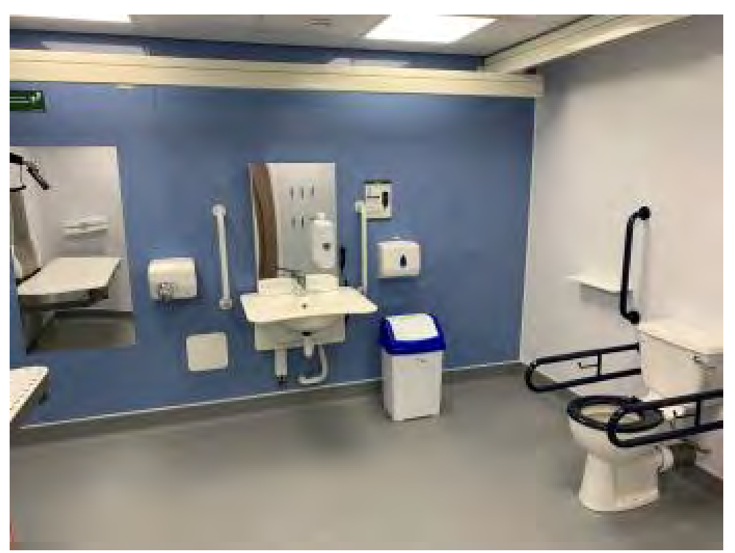
Inside view of CPT with toilet