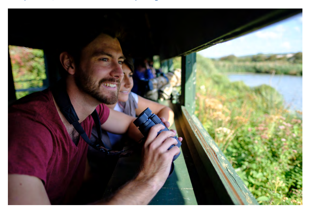
These three wildlife hides all overlook bodies of water with open windows

Scrape hide, Ramsar hide and Lapwing hide