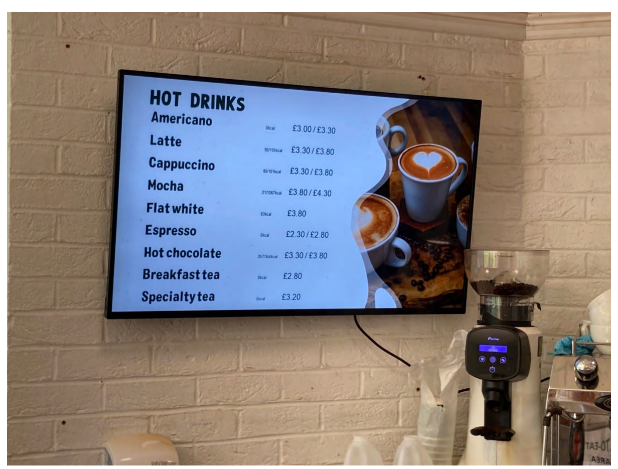
This is one of the electric price boards in the Waterside Café servery area