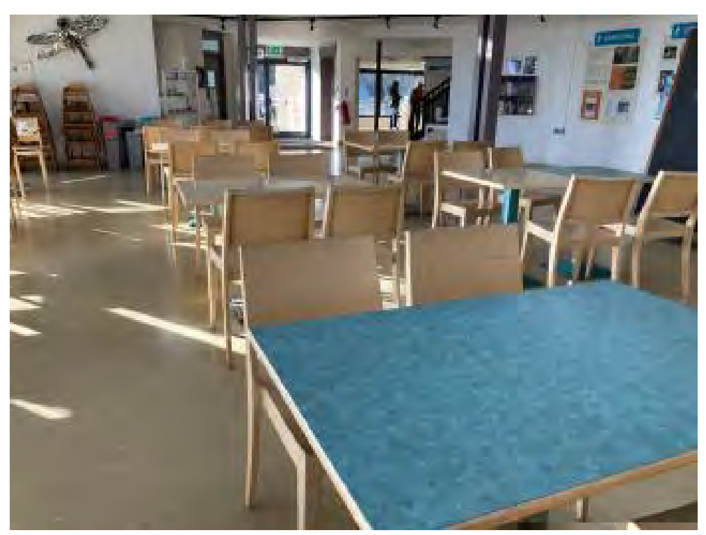
This is the seating area for the Water's Edge Café