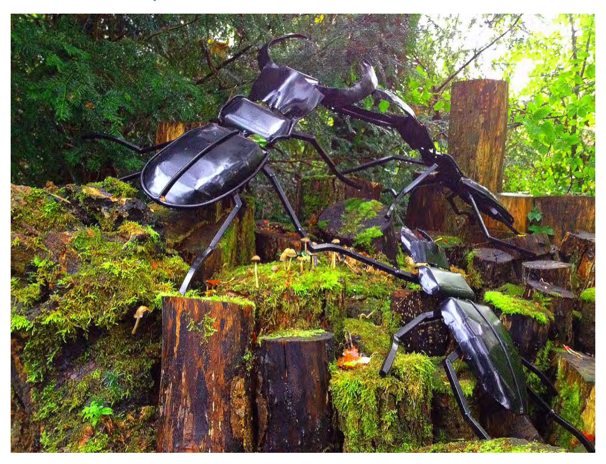
The woodloop has a sculpture of stag beetles in it near bird feeders