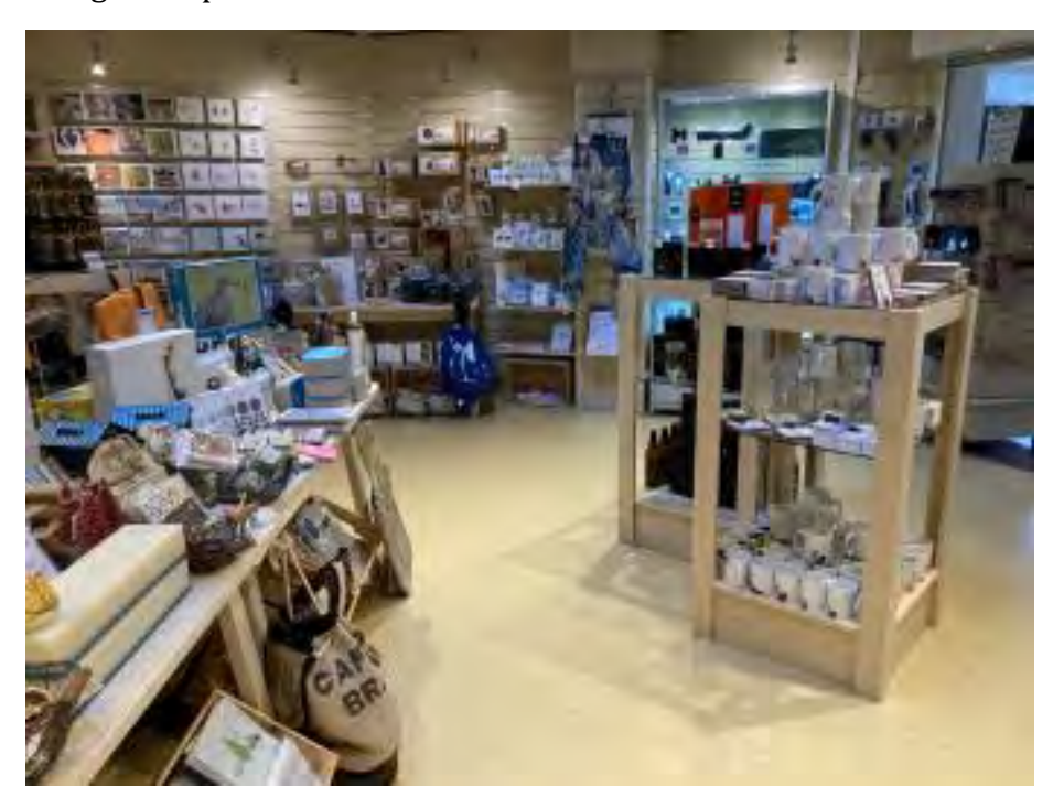
Inside the Gift Shop