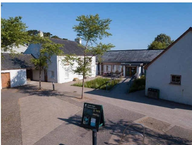
Main entrance to visitor centre