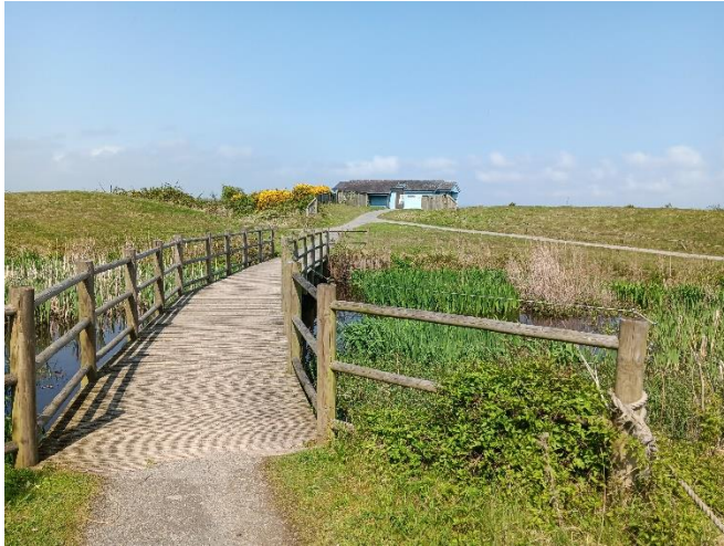
Path and bridge leading to Brent hide