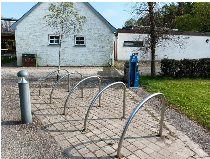
Bicycle parking and toolkit station