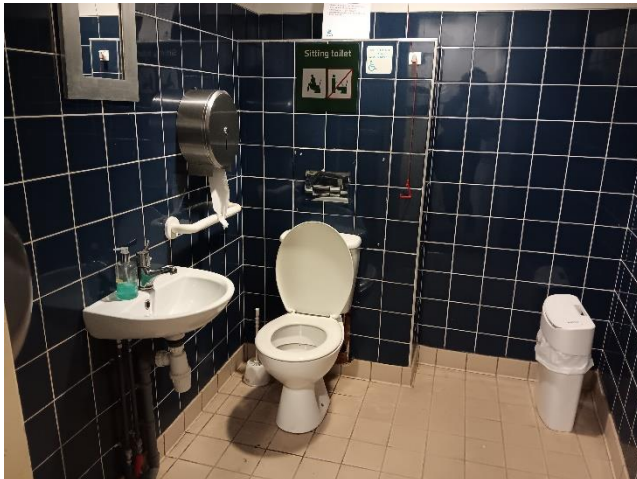
Toilet in the Limekiln Observatory