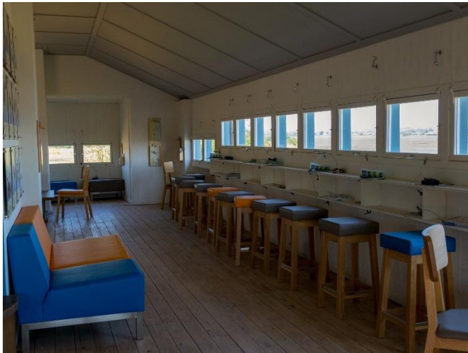
Inside the Brent hide