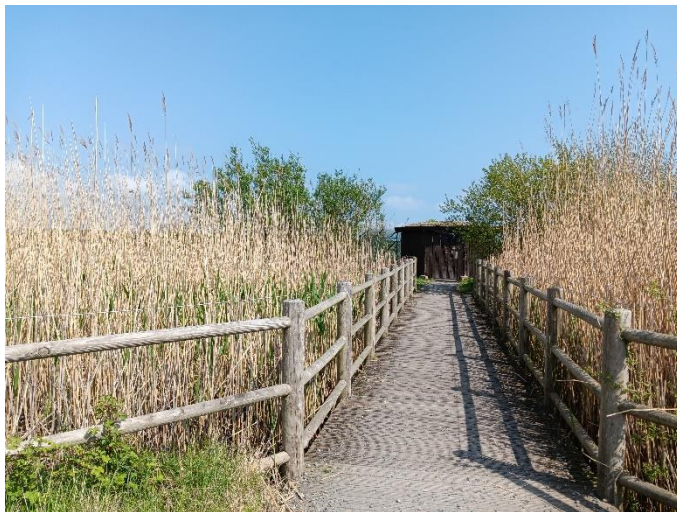
Bridge after Crannog, leading to push gate