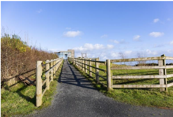
Path up to Limekiln Observatory