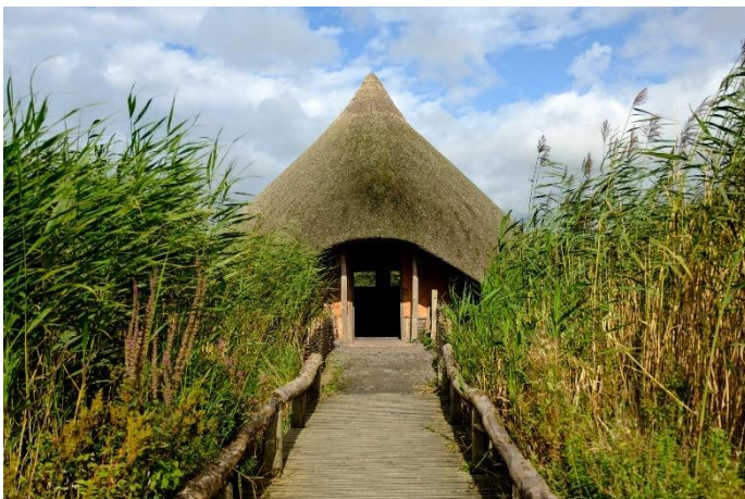
Entrance to Crannog Roundhouse