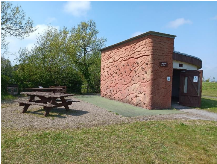
Picnic area at Limestone Pavilion

There are benches and picnic tables located across the reserve where visitors can rest and eat. These are often next to large, open grass areas or play areas.