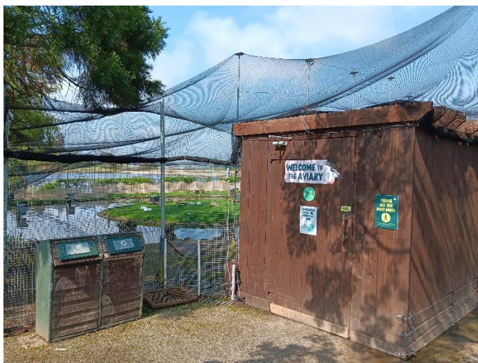
Entrance to Aviary