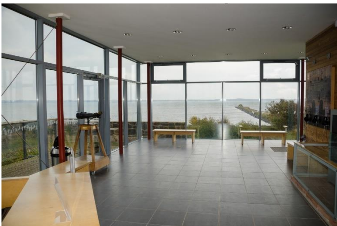
Inside the Limekiln Observatory