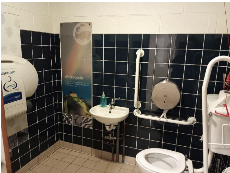
Accessible toilet at the rear of the visitor centre