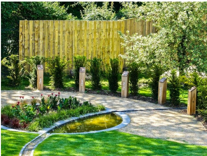
Sensory Garden path