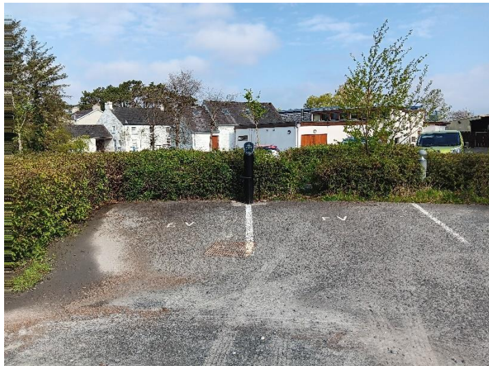
2 EV charging points