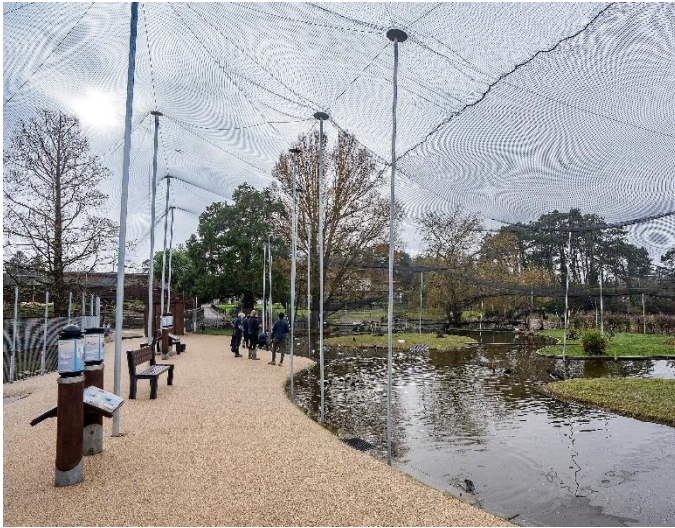
Inside the Aviary