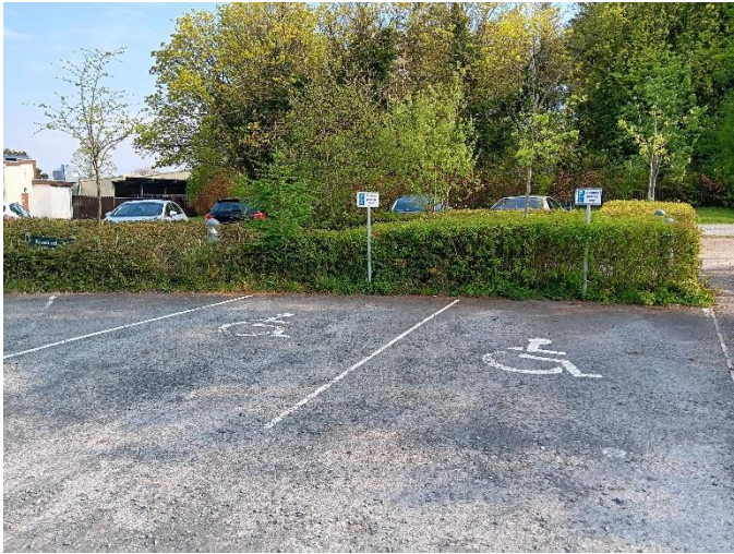
5 disabled parking bays at the front of the car park