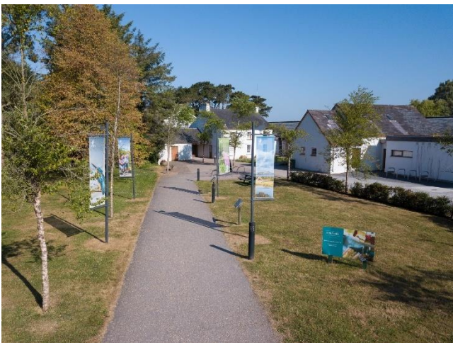
Path from car park to visitor centre